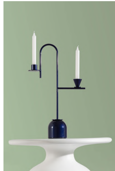
Discover Blue Candleholders